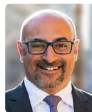
Mr Peter Khalil MP Chair of Joint Parliamentary Joint Committee on Intelligence & Security