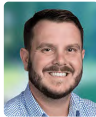
Phil Thompson MP Shadow Assistant Minister for Defence