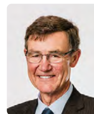
Sir Angus Houston Co-Author of Defence Strategic Review