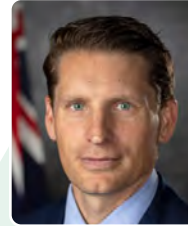
Hon Andrew Hastie MP Shadow Minister for Defence