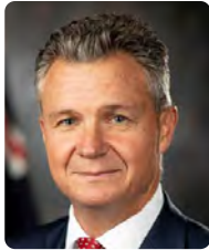
Hon Matt Thistlethwaite MP Assistant Minister for Defence and for Veterans' Affairs