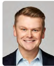
Mr Keith Wolahan MP Co-Chair of the Parliamentary Friends of Defence Industry