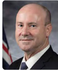
Greg Moriarty Secretary of Department of Defence