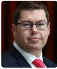
Hon Pat Conroy MP Minister for Defence Industry