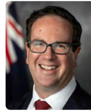
Hon Matt Keogh MP Minister for Defence Personnel and Minister for Veterans' Affairs