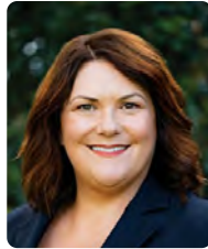
Ms Meryl Swanson MP Member for Paterson, Member of Joint Standing Committee on Foreign Affairs, Defence & Trade