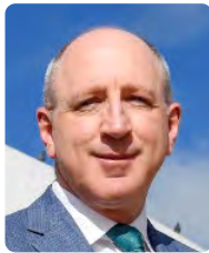
Hon Luke Howarth MP Shadow Minister for Defence Industry and Shadow Minister for Defence Personnel